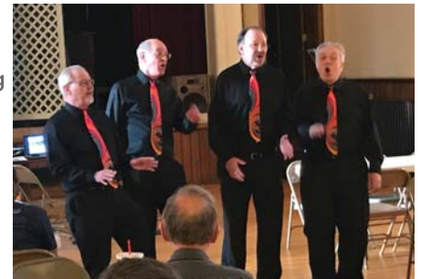
A Southern Gateway Chorus quartet performed during the town hall meeting

As we hope you already know, we've identified six "pathways", or focus areas, to channel our future brainstorming work. And we are now looking for neighbors to join working groups around these six themes: Housing & Development, Jobs & Businesses, Nature & Health, Youth & Families, Close & Connected, and Caring Community. Hoping you will be attracted to one or more of these focus areas to join in a group conversation. This should be a fun way to work on neighborhood ideas and to meet some of your neighbors. There will be more information and discussion about our working groups at our upcoming May Community Council meeting on May 14. If you're interested or want to learn more, email: springgrovevillage2.0@gmail.com or call 513-400-3562. You can also checkout all the feedback and ideas from the kick-off on our project webpage: www.cincinnati-oh.gov/sgvplan .