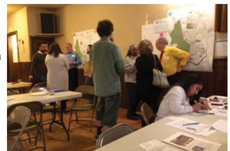
SGV residents, business owners, and City Planning staff discussed the future of SGV