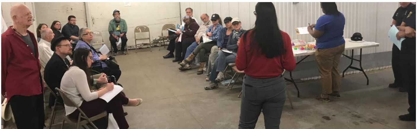
April Community Council meeting at Spring Grove Self Storage