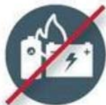
No Batteries, Flammables or Fuel Tanks