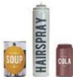
Aluminum, Steel Cans/Containers & Aerosol Cans