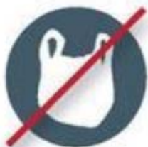
No Plastic Bags or Plastic Wraps