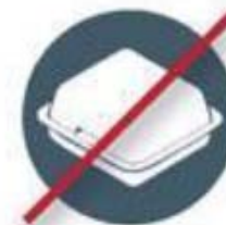
No To-Go Containers