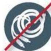
No Tangles, Cords, Hoses or Chain

TO LEARN MORE, call 513-352-3200 or visit cincinnati-oh.gov/recycling