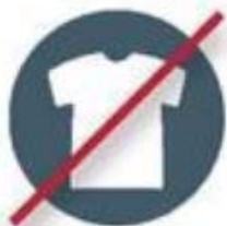
No Clothing or Linens (drop-off for donation)