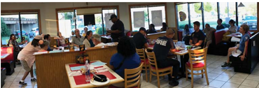
September Community Council meeting at Gold Star Chili