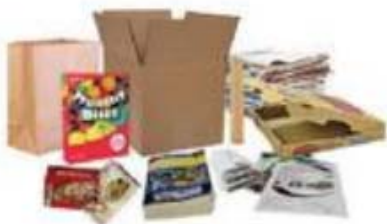
Paper & Cardboard