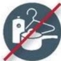
No Scrap Metal, Pots and Pans